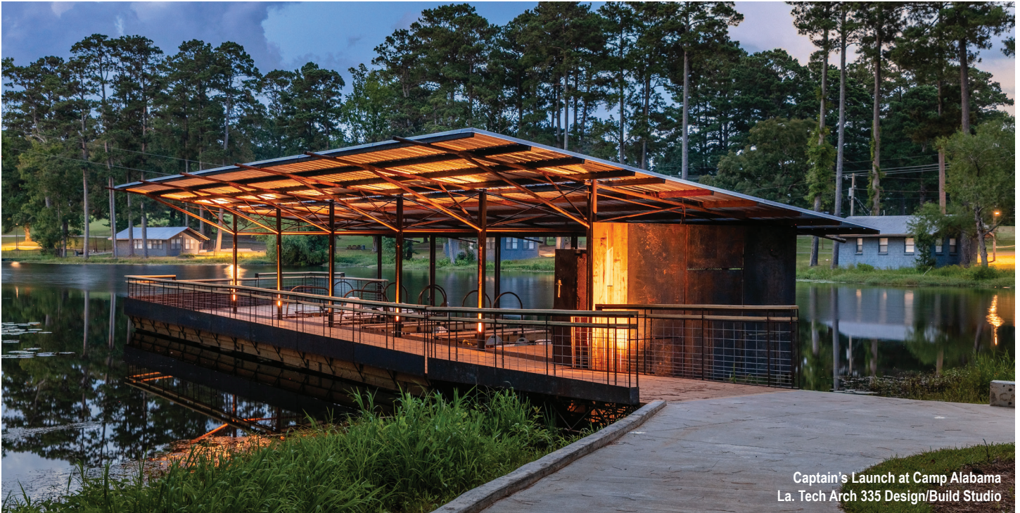
Captain's Launch at Camp Alabama La. Tech Arch 335 Design/Build Studio

The board is currently working on more NOIs which will be published during 2026. As mandated by the legislature and the Governor, every rule will be reviewed, and in due course many will be updated.