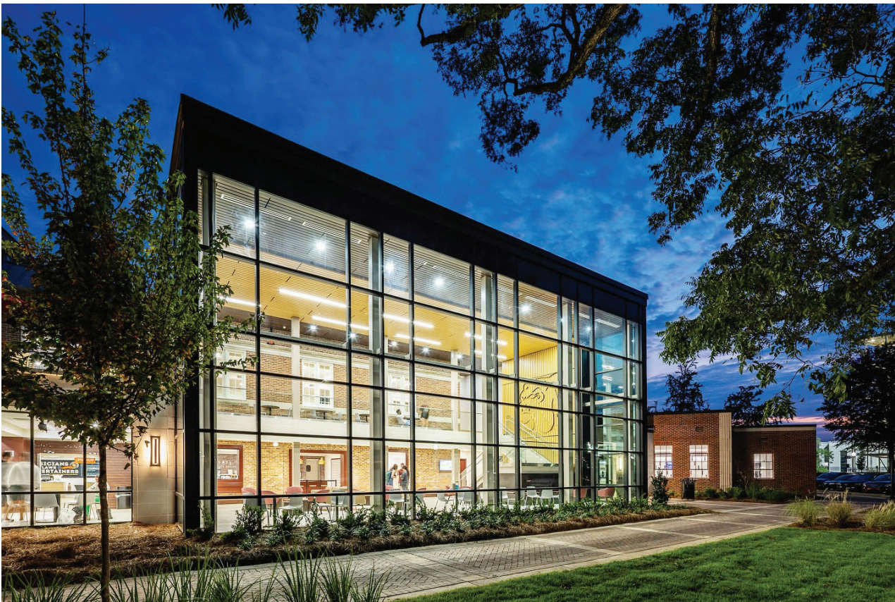
Renovated historic Perry Hall at Mississippi State University