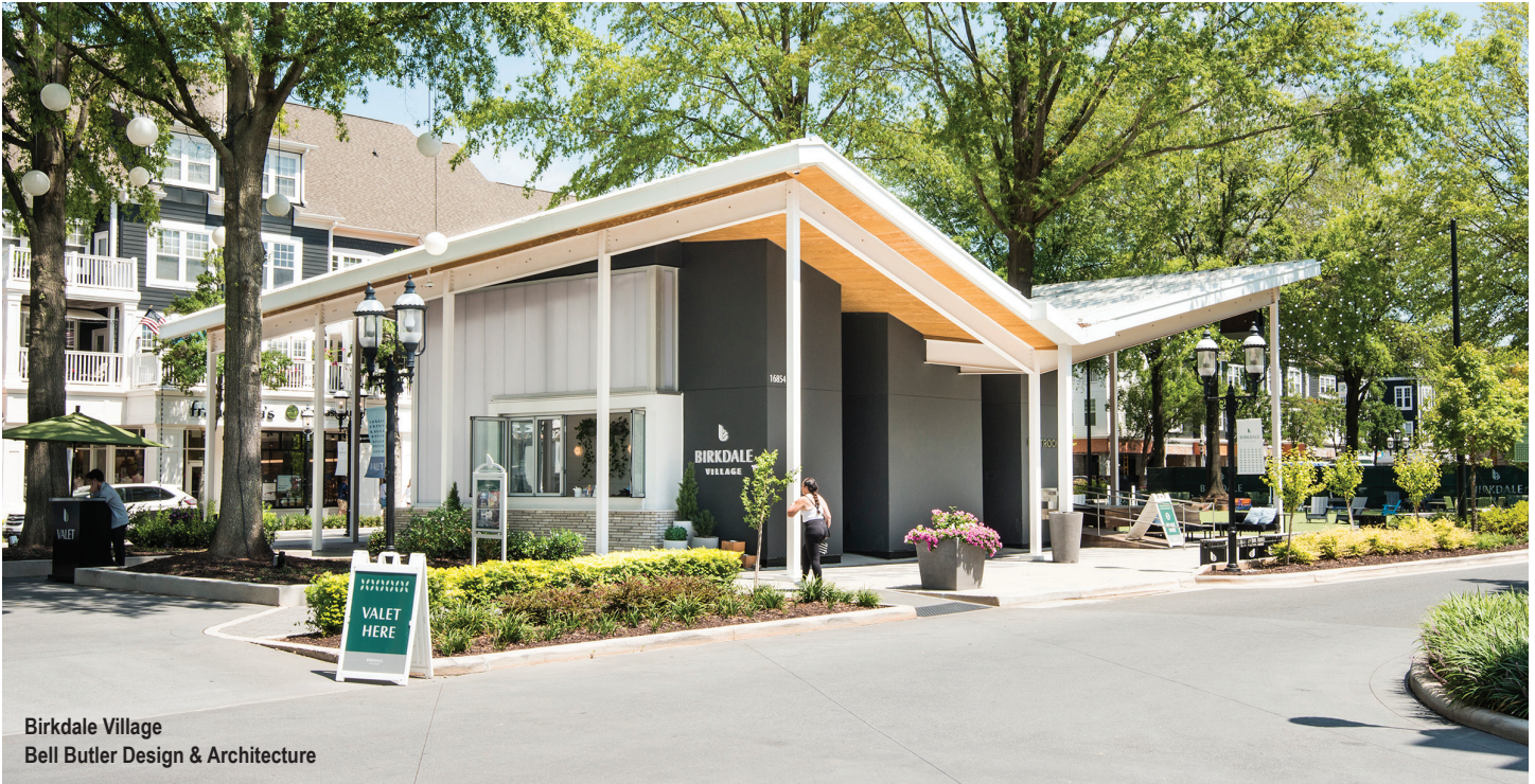
Birkdale Village Bell Butler Design & Architecture