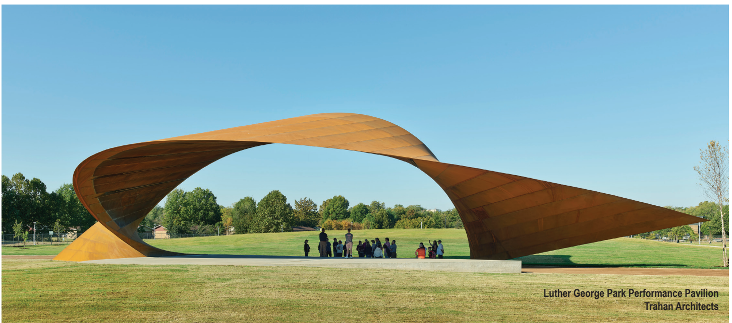
Luther George Park Performance Pavilion Trahan Architects