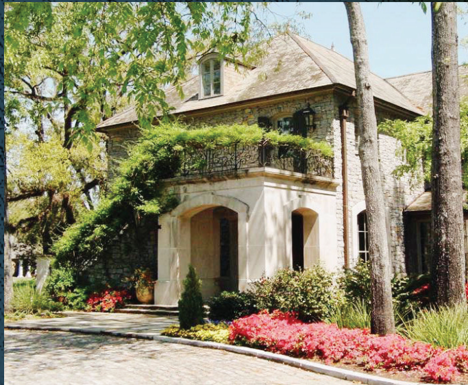
Residential project Al Jones Architects