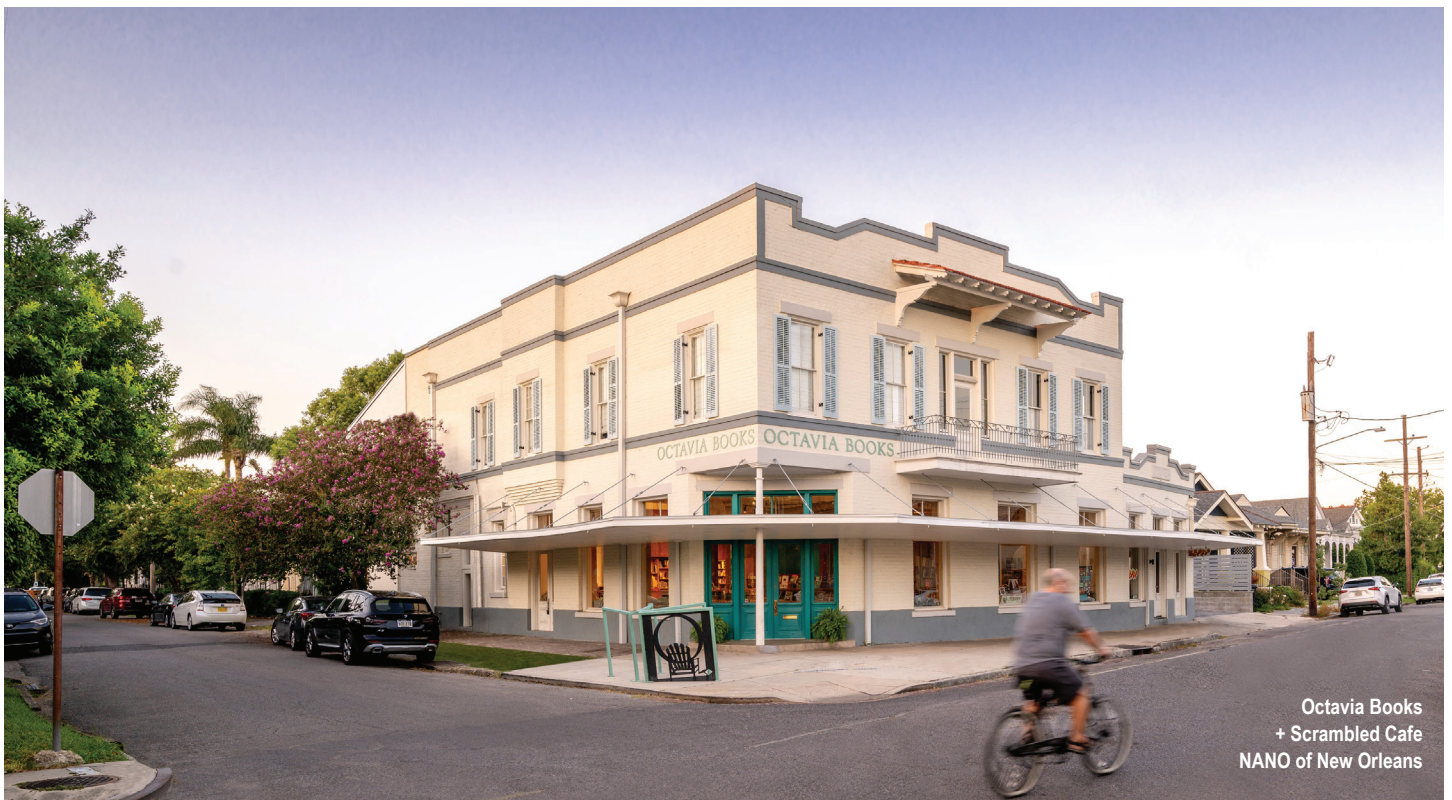
Octavia Books + Scrambled Cafe NANO of New Orleans

As always, please let me know of any suggestions that you may have to improve our service to you. Thank you for your continued support and partnership with this office!