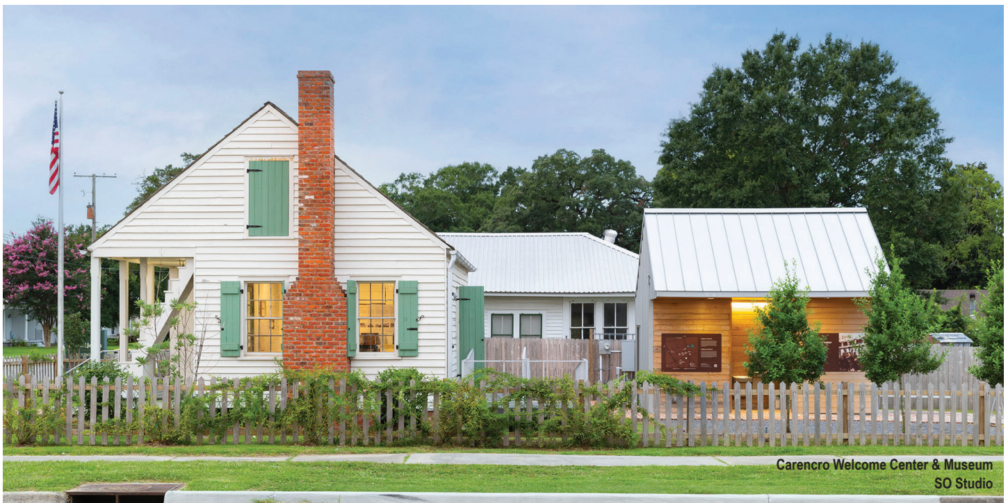
Carencro Welcome Center & Museum