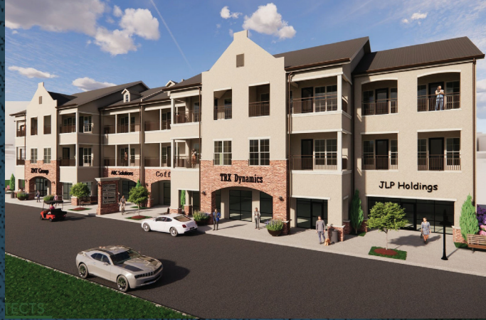
3D Rendering of building renovation Ackal Architects