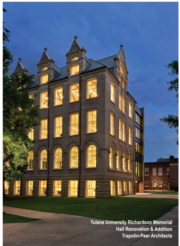
Tulane University Richardson Memorial Hall Renovation & Addition Trapolin-Peer Architects