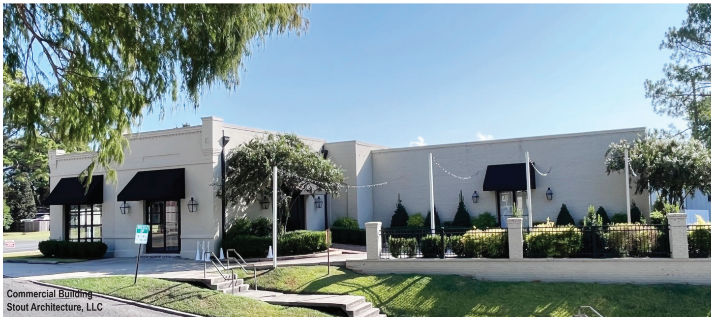
Commercial Building Stout Architecture, LLC