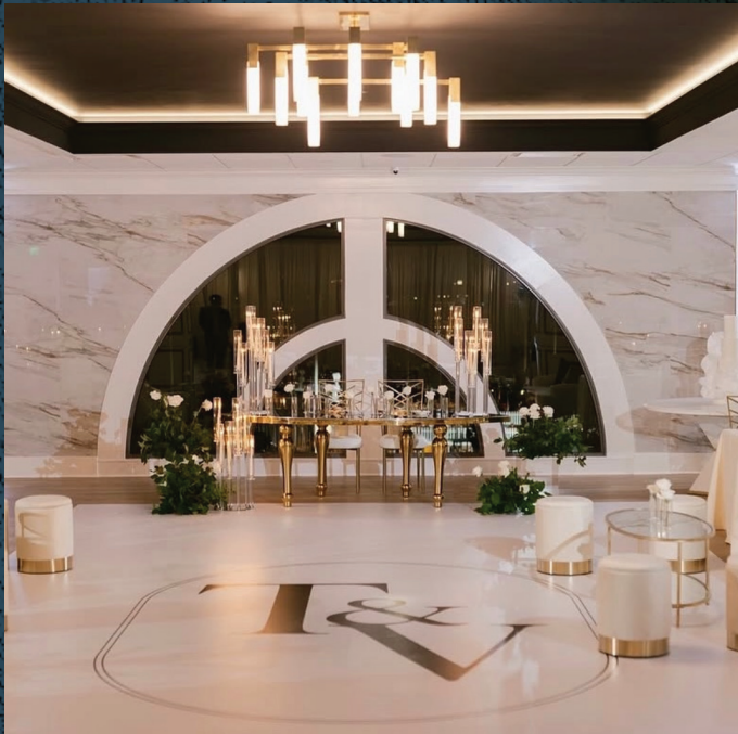
Nouveau River Room Jessica Becker Architecture

Office hours are 7:30 am to 4:00 pm Monday – Friday www.lsbae.com