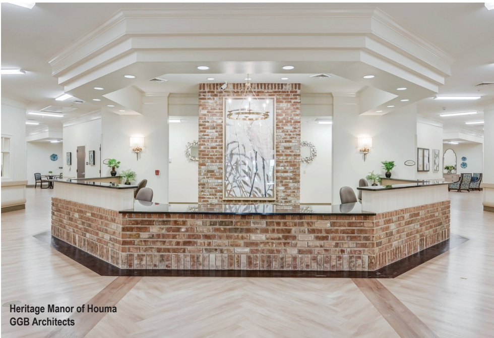
Heritage Manor of Houma GGB Architects