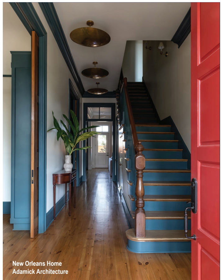
New Orleans Home Adamick Architecture

Disclaimer: Every effort has been made to ensure that the aforementioned information is correct; however, it should not be relied upon without verification from the Board office. Please note that the names of companies and individuals listed may be similar to other parties who have not had disciplinary or enforcement actions taken against them.