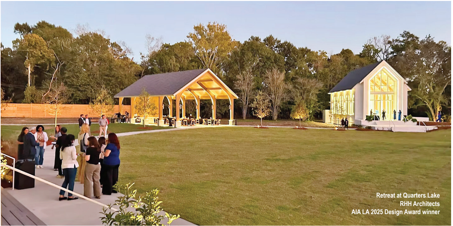
Retreat at Quarters Lake RHH Architects AIA LA 2025 Design Award winner