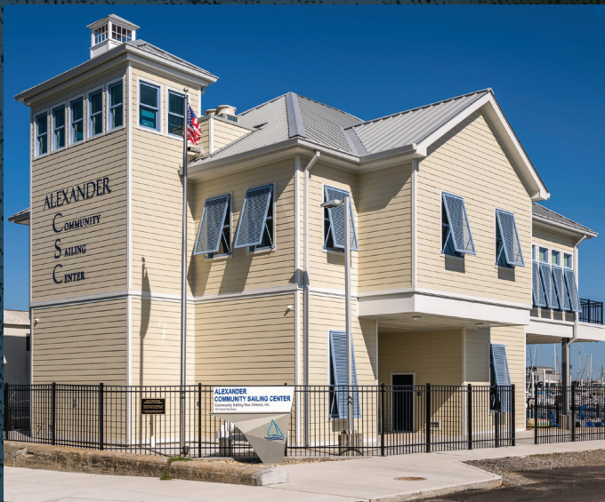
Alexander Community Sailing Center Mathes Briere Architects